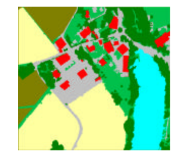
Figure 3: Segmented image on the left and classified image on the right. Blue = water; Red = buildings; Grey = impervious area; Dark Green = trees; Light green = grass land area; Yellow = field 1; Brown = field 2