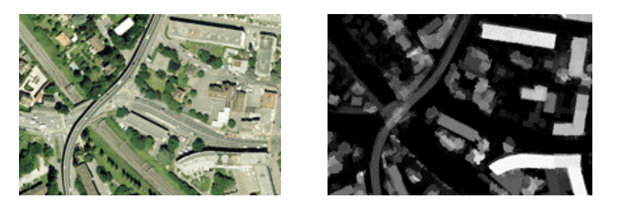
Figure 2: The meadows appear in black as the DHM value equals 0 and the trees brighter as the values are higher

The Digital Elevation Model has been used to discriminate the objects according to their height. For example, even if the spectral information of trees and grass is similar, they could be easily differentiated with the Digital Height Model value (DHM, Figure 2). The same approach could be applied to buildings vs roads.