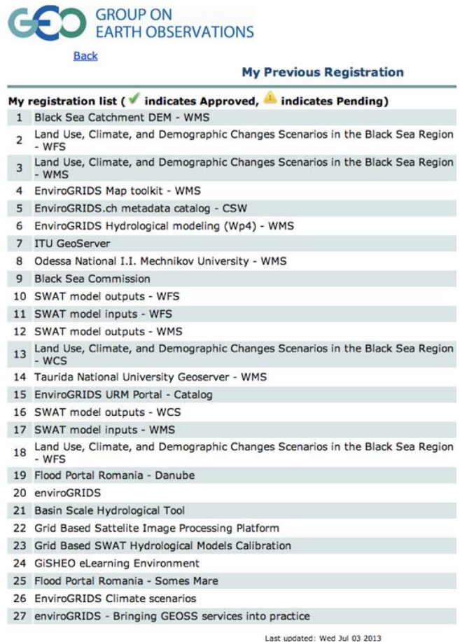
Fig. 2. EnviroGRIDS resources registered in GEOSS.

Additionally, the project created new datasets to explore different scenarios of climate, land cover and demographic changes in the Black Sea catchment, and their impacts on water resources. Several pilot studies were also implemented in different countries on the other GEO Societal Benefit Areas. All the data created by enviroGRIDS is made freely available through web services on the enviroGRIDS portal, where all the available data covering the Black Sea countries are exposed. At the end of the project this has resulted in a set of 27 resources registered into GEOSS (fig.2) corresponding approximately to 300 datasets, giving access to more than 300'000 layers. The effort will continue in different ways. Therefore, this list should increase in the following years.